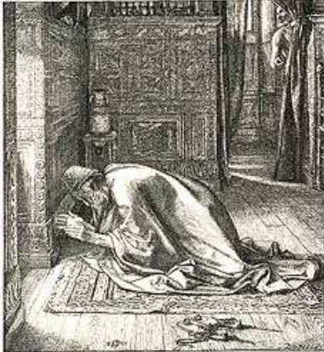
Daniel's Prayer (1865) by Sir Edward Poynter (English neoclassical painter, 1836-1919), from illustrations for Dalziel's Bible Gallery . Relief print on paper, 190 x 175 mm, Tate Collection.

The basis for a Daniel Fast is found in Daniel 10:2-3.